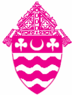
Archdiocese of Newark